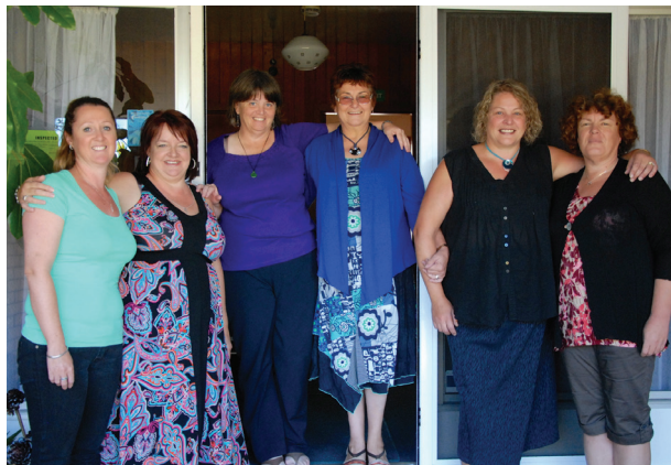
Home & Family Accommodation Team

"Staff were wonderful, any questions answered and if I needed help they helped if they could."