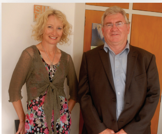
Home & Family Fundraising Team

Our Art Auction in September 2013 has yielded great works of art courtesy of generous artists donating the proceeds from the auctioned pieces. This was a collaborative effort with RE:Start and Chambers 241.