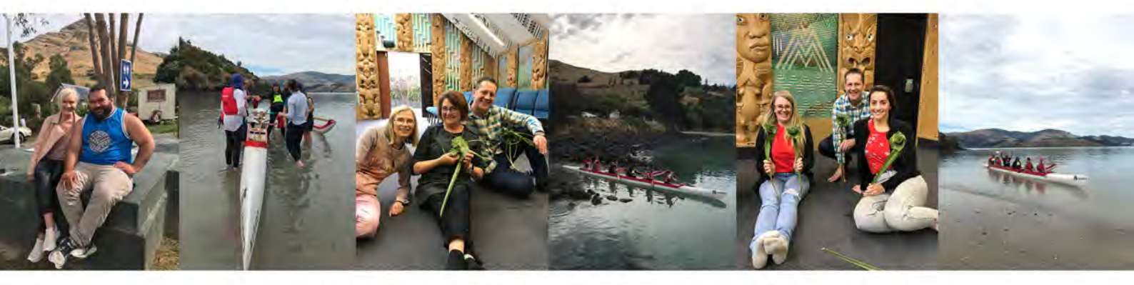
Above, photos from our 2019 staff training days at Rāpaki Marae

We have welcomed whānau from across New Zealand into our parenting programmes again this year and have loved having visits from whānau who have previously stayed with us and who drop in to catch up when they are back in Christchurch. Attendance rates in our counselling service are at a 7-year high and the high level of referrals to the Refocus programme gives an indication of how valued it is within the community.