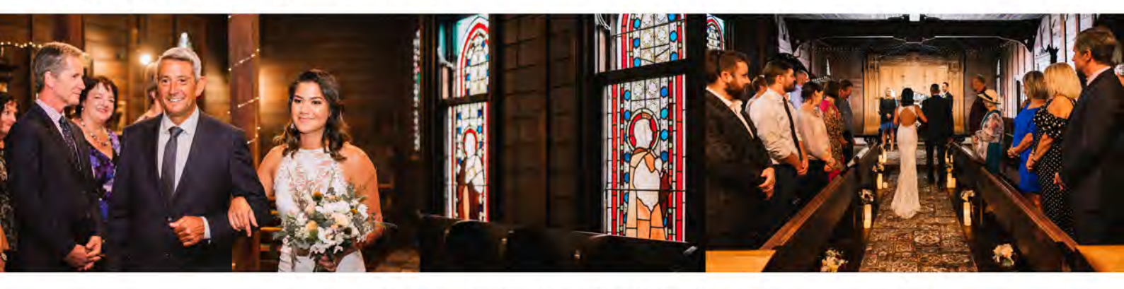
Above, photos from The Little Chapel

The Little Chapel wedding venue was officially launched in 2019, a very successful competition to win a wedding package was held in collaboration with The Breeze and that wedding took place in October. Booking numbers are increasing and we are receiving very positive feedback from happy couples following their weddings.